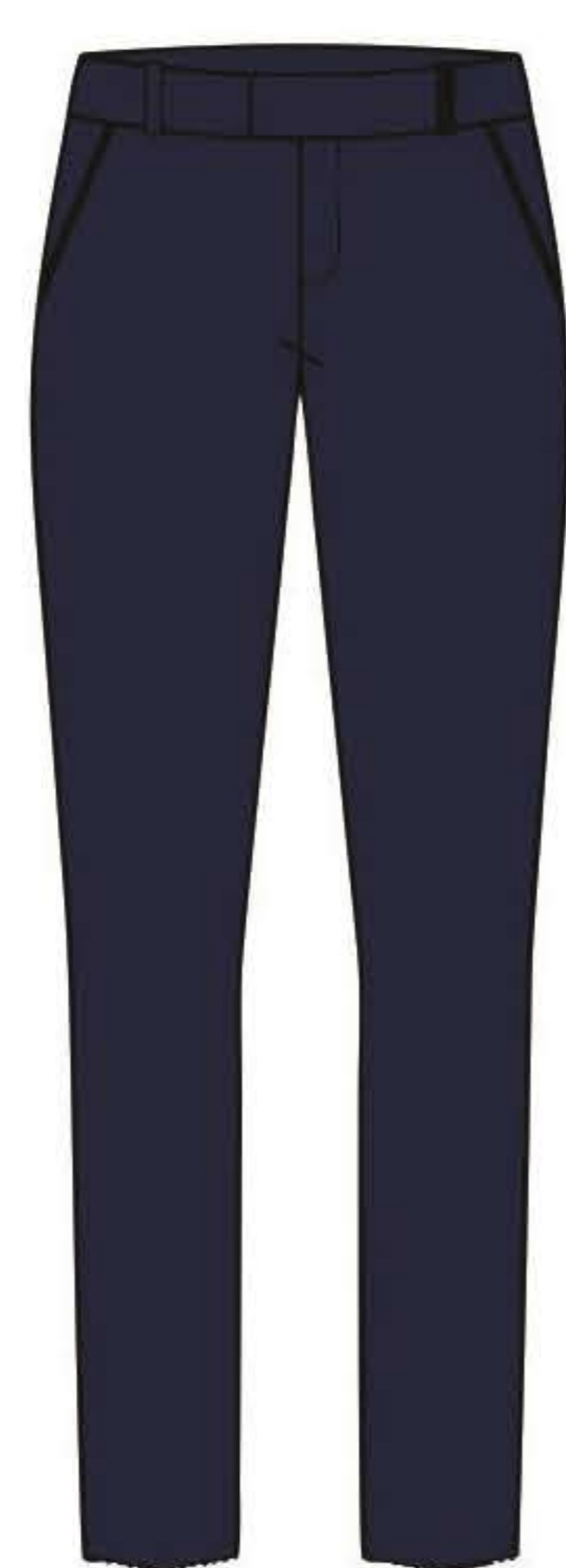
moletom (M/F) tassel (M/F)