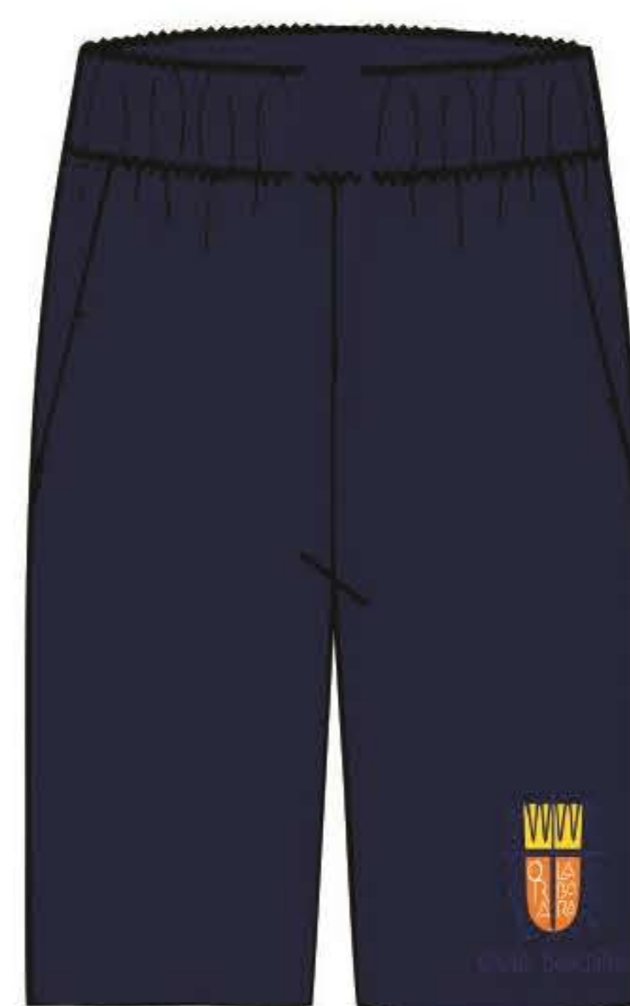
tassel (M) cotton (F)